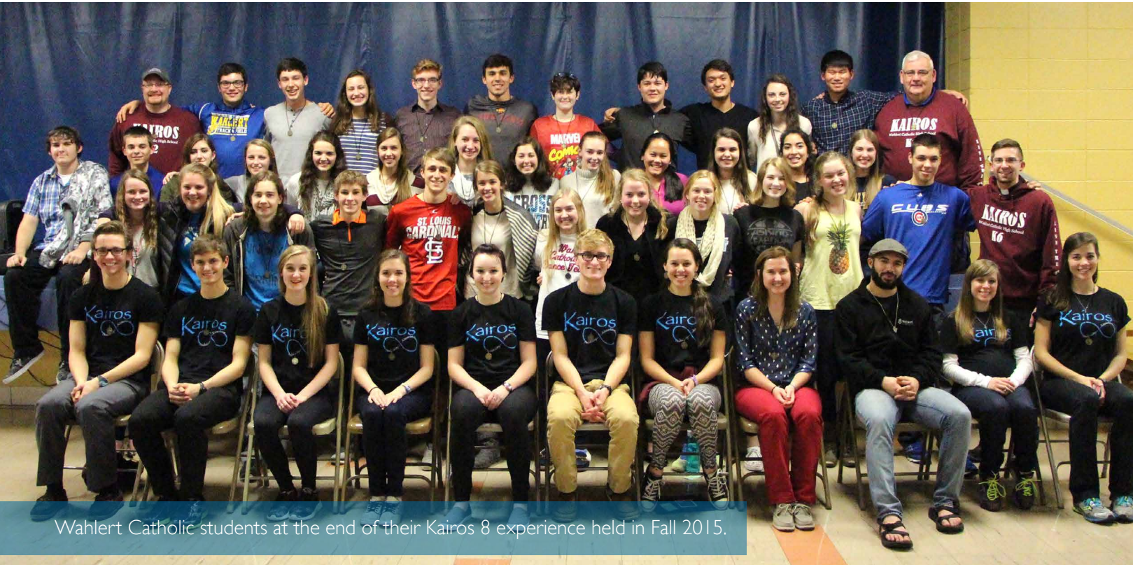
Wahlert Catholic students at the end of their Kairos 8 experience held in Fall 2015.

Juniors at Wahlert Catholic are taking part in a life-changing, faith-building retreat that is causing staff, priests and visitors to notice the stronger focus on faith in students.